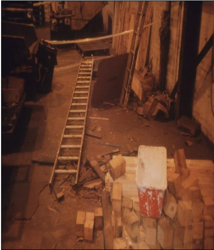
JH, Deceased, Fell 1ft