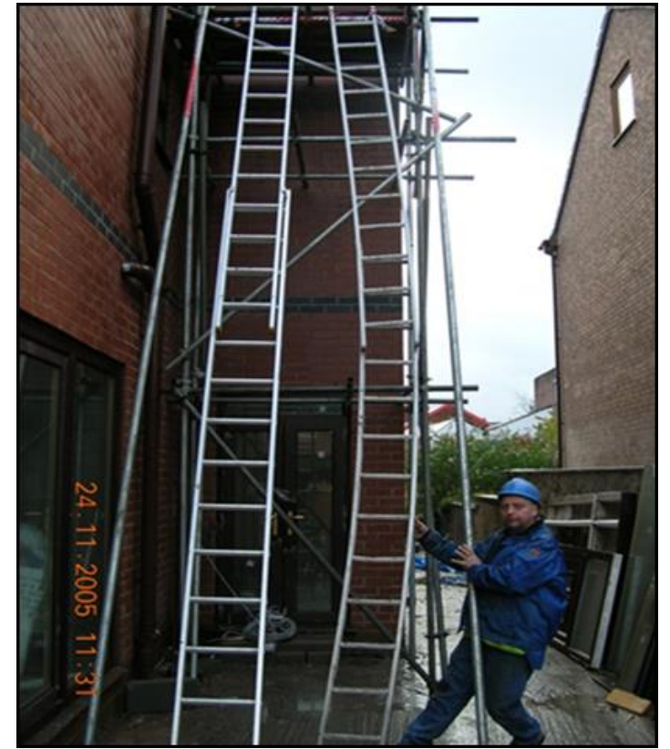
JD, Deceased, Fell 6m