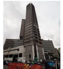
30+ Storey City Centre Hotel

The aims & objectives of day 1 are to ensure knowledge and understanding of the legislative requirements for demolition & refurbishment with demolition covering CDM 2015, L153 & PD/PC roles, and Building Act 1984 etc. How SKTE (Skills Knowledge Training & Experience) and organisation capability assessments are examined and measured. Explains how BS 6187: 2011 Code of practice for full and partial demolition is applied & demystifying the 20 clauses and the 6 annexes. Demolition organisations & training schemes (NFDC / NDTG / IDE etc) are explained.